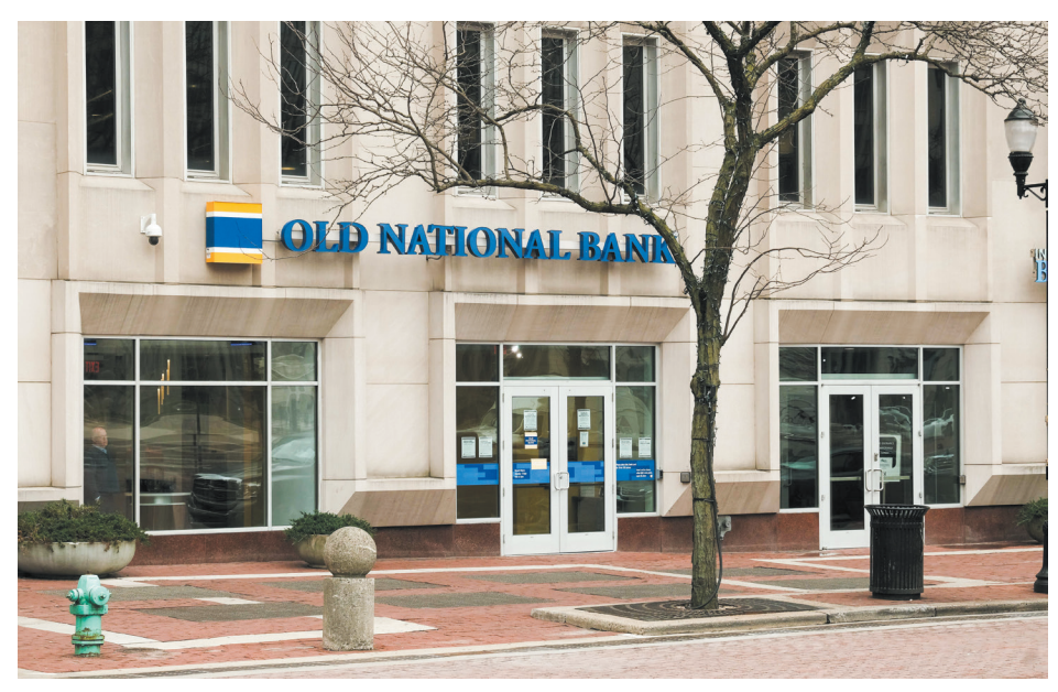
Evansville-based Old National Bank issued the second-most PPP loans to Indiana borrowers, at 4,316, and the most of any Indiana-headquartered bank.

The third-most-active PPP lender is Muncie-based First Merchants Bank, which has $12.4 billion in assets and made 3,547 PPP loans, according to data released this month by the U.S. Small Business Administration, which oversees the PPP program. In total, lenders through June 30 made 79,151 PPP loans to Indiana borrowers.